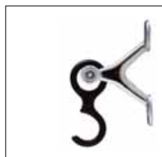
Ambrogino wall fixing