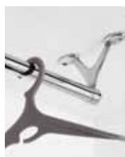
Ambrogino ceiling fixing