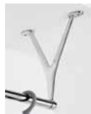
Ambrogio ceiling fixing