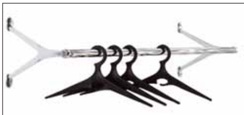
Ambrogio code 1546

Description: modular coat hanger system consisting of a wall-mounting cast enbloc element made from polished aluminium, each element has two support bases, each with a hole for wall/ceiling mounting and a front cylindrical element with a hole to mount the hanger rail using M8 stud bolts or M8 terminal screws M when the bars are mounted continuously. The coat rail is made from 28 mm diameter chrome-plated steel tube with threaded inserts at the ends to fasten the screws or stud bolts.